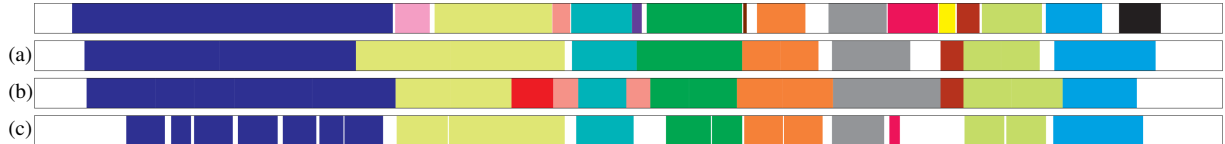
Figure 2. Detection result on rgb-03-1 of 50 Salads. Each class is encoded by another color, background is white. The first row contains the ground truth, the other lines show the detection results of our system with (a) a class-dependent Poisson model, (b) a class-independent Poisson model, (c) the mean length model.